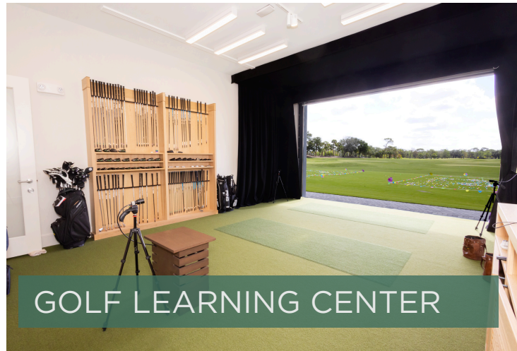
GOLF LEARNING CENTER