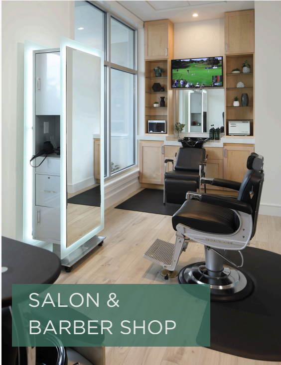
SALON & BARBER SHOP