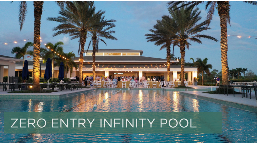
ZERO ENTRY INFINITY POOL