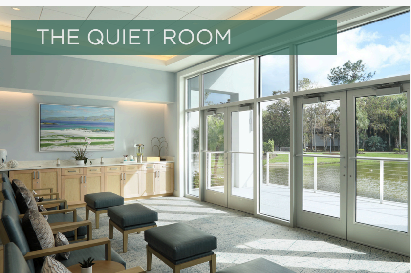
THE QUIET ROOM